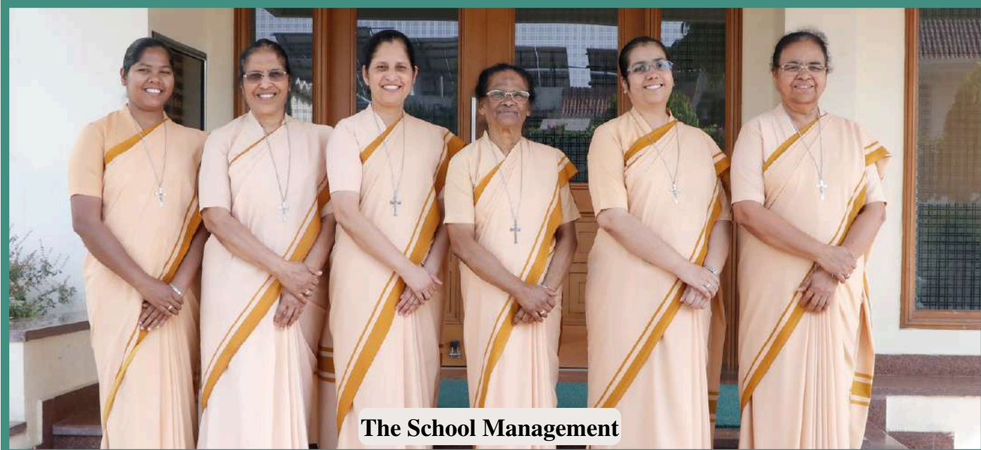
The School Management