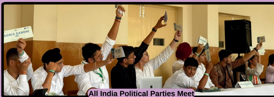
All India Political Parties Meet