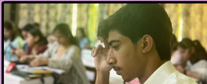
United Nations Convention on Animal Health and Protection

The school hosted Model United Nations for the third time where 550 plus delegates from more than 25 schools from all over Punjab participated in debates and simulations to address the global issues. The objective was to learn about diplomacy, international relations and current world issues. To mention here, MUN is a platform which hones the skills in research, public speaking, writing, critical thinking, teamwork and leadership of the students. In this educational activity, students acted as delegates to the United Nations and the committee members had a good show to put up. Certainly, after being a part of this endeavour, these neophyte leaders will learn to promote peace and harmony in their coming years. Bringing the solutions to the table that are acceptable to a majority of the representatives, the students learnt the art of negotiation, conflict resolution and cooperation.