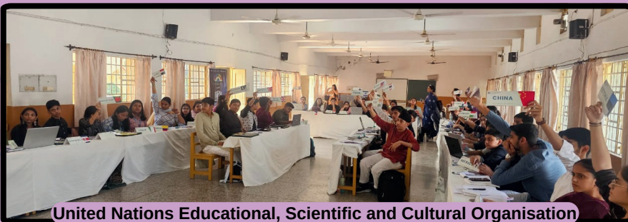
United Nations Educational, Scientific and Cultural Organisation