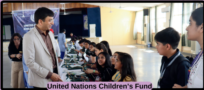
United Nations Children's Fund