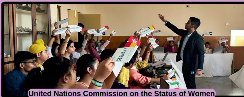
United Nations Commission on the Status of Women