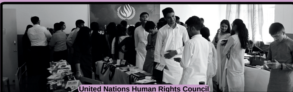
United Nations Human Rights Council