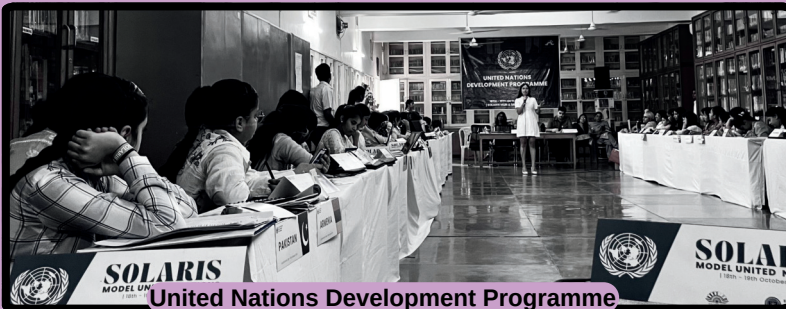
United Nations Development Programme