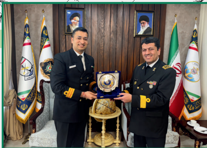
Presenting memento to Head of Health of Iranian Navy at Imam Khomneini Naval University, Iran

As I pen down these thoughts, memories of my school days come rushing back—days filled with academic sojourn by dedicated teachers, friendships, discipline, and the relentless pursuit of excellence. My journey from the corridors of St Joseph's Convent School to the Armed Forces has been one of challenges, growth, and immense pride. School is where dreams take shape, and for me, it was where the foundation of duty, integrity and perseverance was laid. The values are instilled in me—discipline from morning assemblies, resilience from sports fields, and leadership from various school activities—became the guiding principles of my life. This foundation kept me in good stead, even in the company of Medical Cadets from the best schools of India's metros and ones from abroad at one of the top medical colleges of the country viz. Armed Forces Medical College, Pune. Joining the Armed Forces was not just a career choice; it was a calling. Journey from being posted as a Principal Medical Officer of the frontline Warships of Indian Navy, to