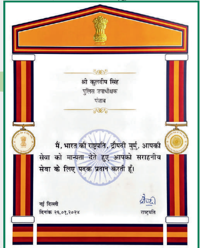
Awardee of The President's Police Medal

As a proud alumnus of St Joseph's Convent School, Bathinda (1984 Batch) I am thrilled to share my journey and achievements with the school community. The foundation laid during my time at the school played a pivotal role in shaping my personality, skills, and values. The school's emphasis on discipline, hard work, and perseverance instilled in me the confidence and determination to pursue my dreams. After completing my education, I joined the police force and had the privilege of serving the society as a Deputy Superintendent of Police (DSP). Throughout my career, I have been fortunate to achieve several milestones, such as successfully leading high-profile investigations, implementing community policing initiatives, and receiving awards such as two DGP DISCS and more than 45 Commendation Certificates.